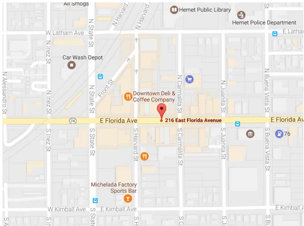
Detail Map - 216 East Florida Avenue, Hemet, California.

Please note - Parking is on the streets surrounding the theater and in a few small lots to the north and northeast of the theater. Come early for a better parking space!